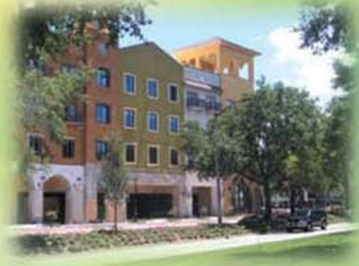
Veranda Park 2295 S. Hiawassee Rd., Suite 101 Orlando, FL 32835 407.902.2533