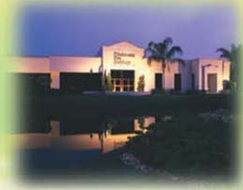
Daytona Beach 110 Yorktowne Dr. Daytona Beach, FL 32119 386.788.6696